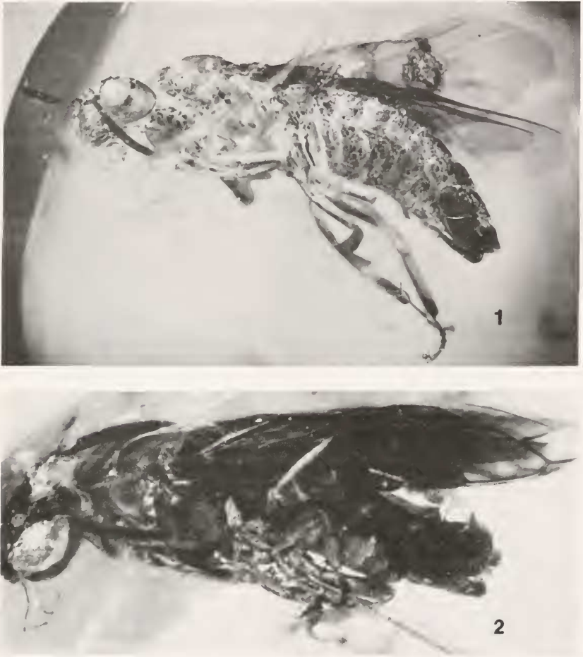
Figs. 1, 2. 1, Didymia dominicana (H-10-48-A). 2, D. davisii (#10500).

venation poorly visible, but radial cell of forewing closed with long accessory vein. Sheath rounded at apex in lateral view, appearing slender in dorsal view, without scopae.